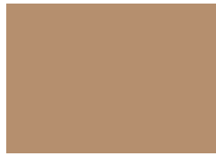
FIESTA CC320 (B)