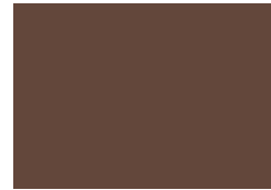
AUTUMN BROWN CC050 (D)