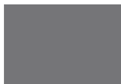
SILVER GRAY CC770 (A)