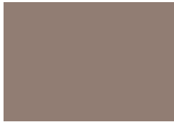
PHOENIX TAN CC575 (A)