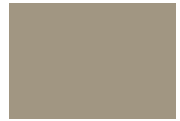
AUSTIN BUFF CC047 (A)